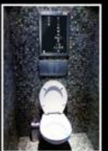
This ad was published in bar toilets